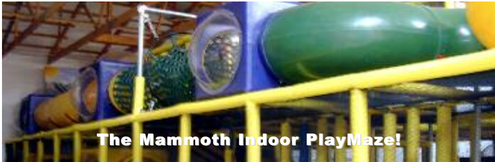
The Mammoth Indoor PlayMaze!

At Maize Quest, parents, teachers, kids, leaders, and followers explore much more than a maze and find much more than 'the exit'.